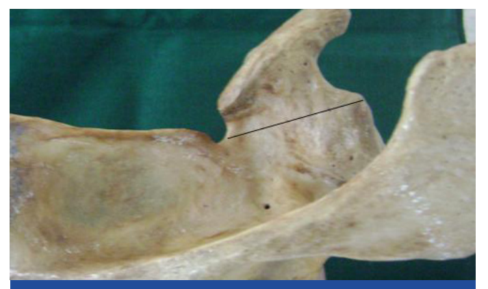
[Table/Fig-2]: Showing the distance between suprascapular notch and margin of glenoid cavity