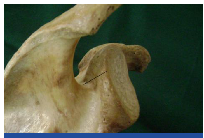
[Table/Fig-3]: Showing the distance between spinoglenoid notch and the margin of glenoid cavity